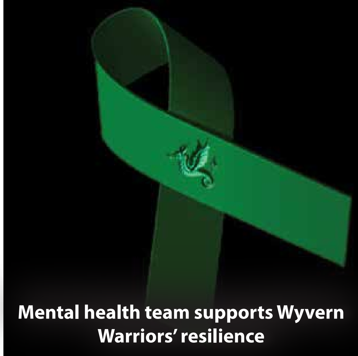
Mental health team supports Wyvern Warriors' resilience