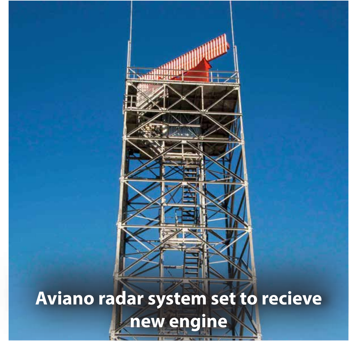
Aviano radar system set to receive new engine

For more stories visit www.aviano.af.mil