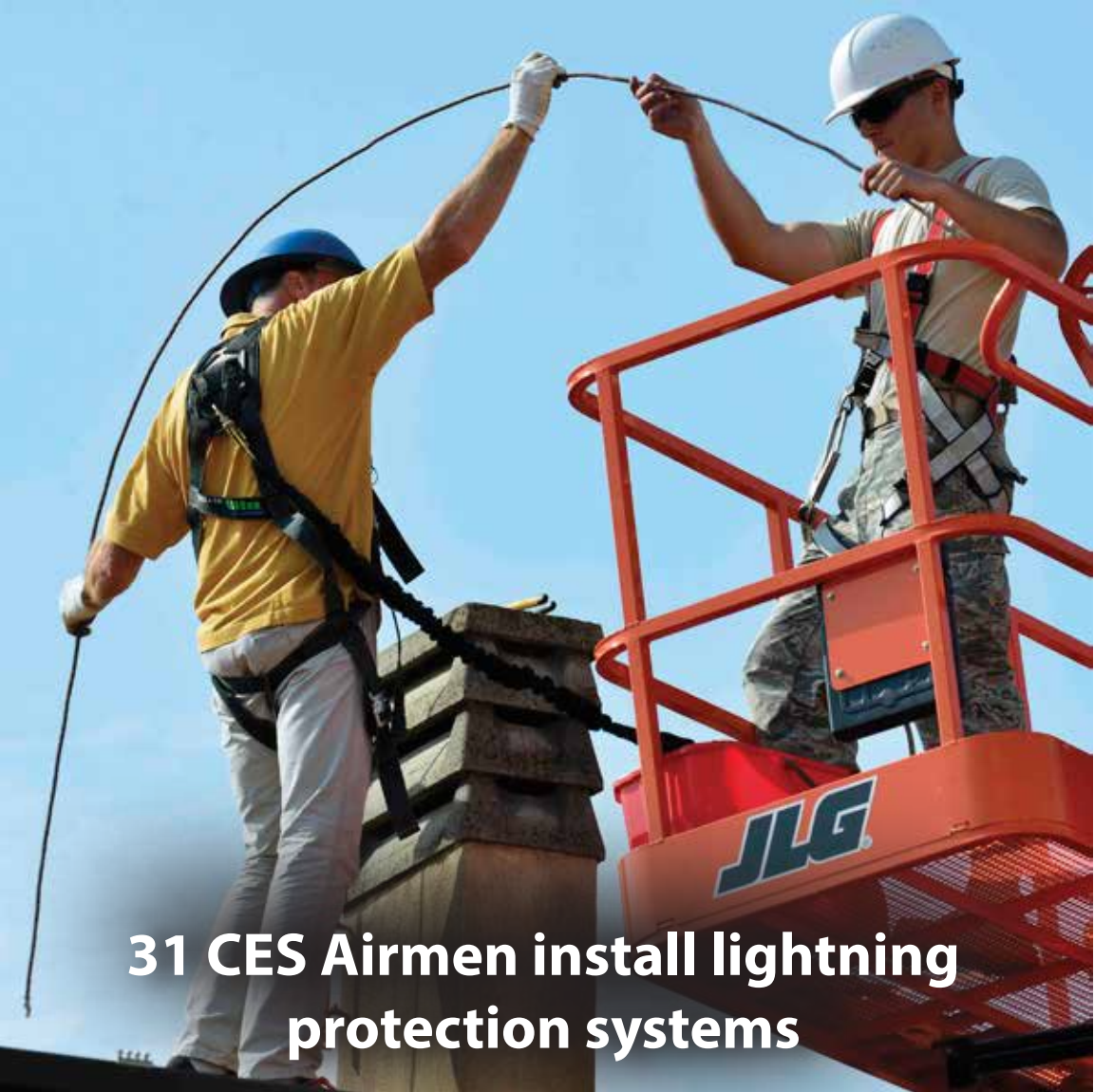
31 CES Airmen install lightning protection systems